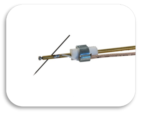
"S" style – Screw mount