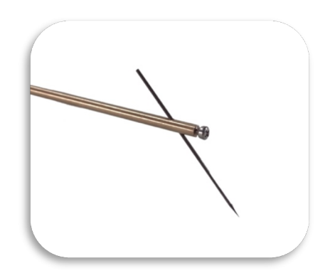
"S" style – Screw mount

The "P" or Spring Clip option probe tip mount allows for a quick and easy probe change without the need for any tools.