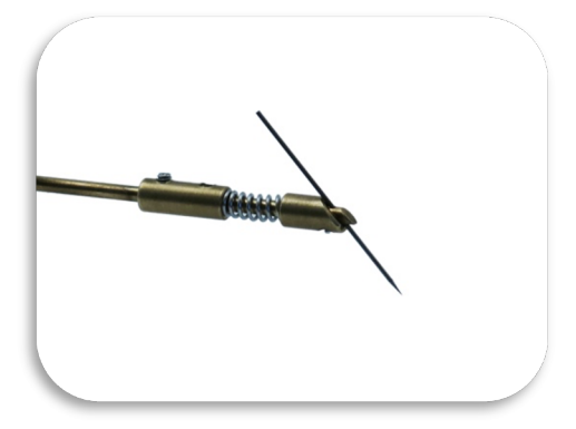
"P" style – Spring clip